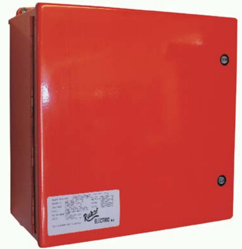
L-854 Radio Receiver/Decoder (P/N: 47-RDL854-1A)