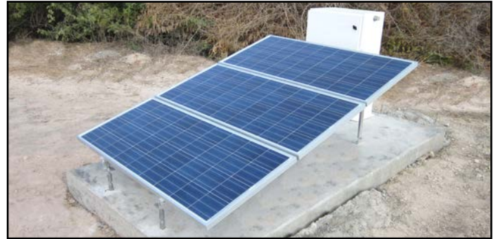
Solar Power Option

The solar power option equips the system to run with free, renewable energy from the sun. Unprecedented in the industry, this green feature is the ideal long-term investment. Ongoing savings afforded by utilizing solar energy are calculated over the lifetime of the installation. Custom solar packages are available to fit your specific load requirements.