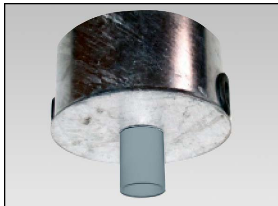
Base Can Shown with Fittings Installed