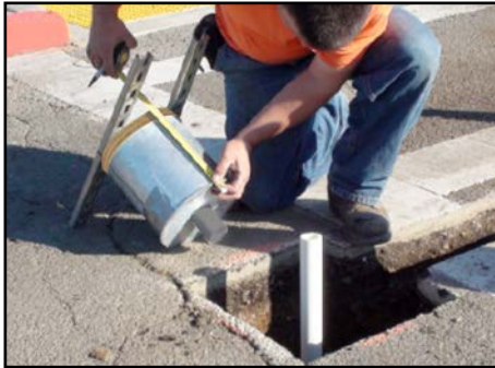
Mounting Jig Attached to Base Can