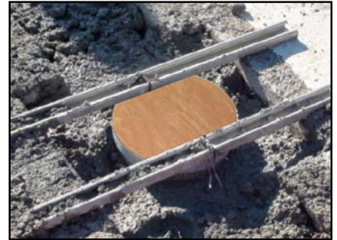
Installed Base Can