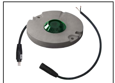
Fixture and Connector