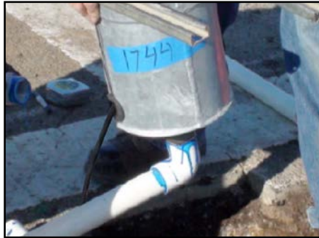
Base Can Attached to Drain Conduit