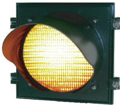
Shown with amber LED

** Call for availability. Some sizes or styles may not be available in these voltages.