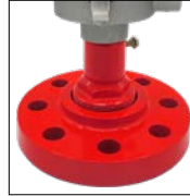
Shown with Frangible Coupling and Floor Flange