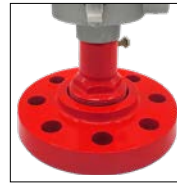
Shown with Frangible Coupling and Floor Flange