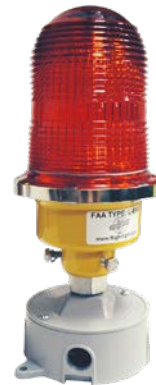
Shown with optional Low Surface Mount (11.25" overall height)