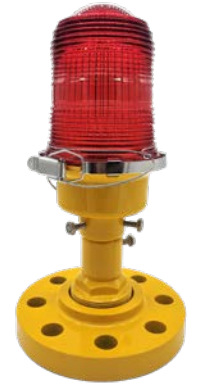
Shown with Frangible Coupling and Floor Flange