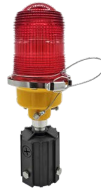
Shown with optional 2" Pole Mount