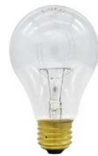
Incandescent Lamp Included