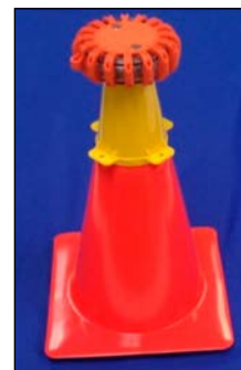
Magnetic PowerFlare lights attach to an internal piece of metal in the CTA-001.