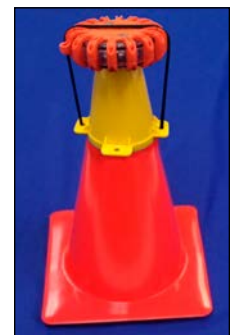
PowerFlare lights without magnets attach to the CTA-001 with included elastic cords.

+1.800.806.3548 USA +1.916.394.2800 Worldwide