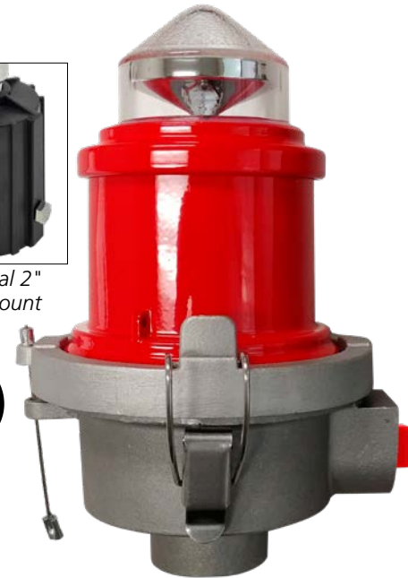
Single L-810 LED Steady-Burning Red Obstruction Light