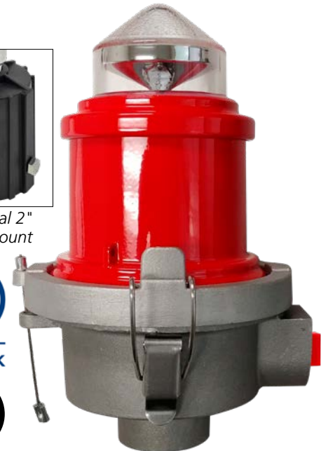
Single L-810 LED Night Vision Compatible Obstruction Light