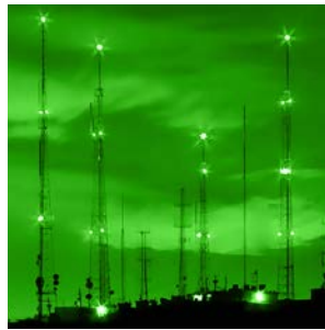
Night Vision Compatible Obstruction Light

Our Night Vision Compatible, omni-directional, red, steady-burning, LED obstruction light is designed for marking tall structures such as buildings, towers, masts, cranes, meteorological towers, chimneys and other hazards to aircraft. This energy-saving LED light is a direct replacement for incandescent fixtures, providing years of reliable and maintenance-free operation. Available in single, double, and retrofit configurations; optional solar drive package.