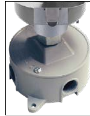
Optional Low Surface Mount