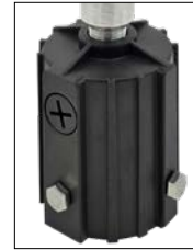
Optional 2" Pole Mount