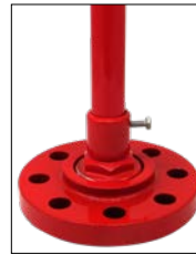
Shown with Riser, Frangible Coupling and Floor Flange