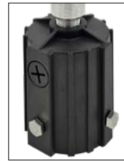
Optional 2" Pole Mount