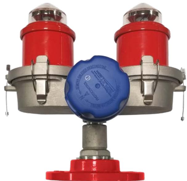
Double L-810 LED Obstruction Light with Optional Photocell

+1.800.806.3548 USA +1.916.394.2800 Worldwide