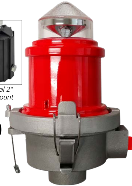
Single L-810 LED Steady-Burning Red Obstruction Light