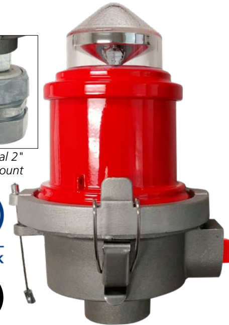
Single L-810 LED Night Vision Compatible Obstruction Light