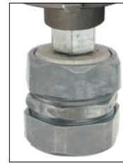
Optional 2" Pole Mount