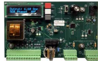
Microprocessor control for reliable current regulation