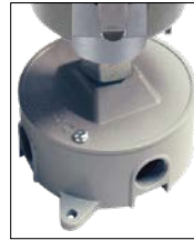
Optional Low Surface Mount