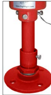
Shown with Riser, Frangible Coupling and Floor Flange