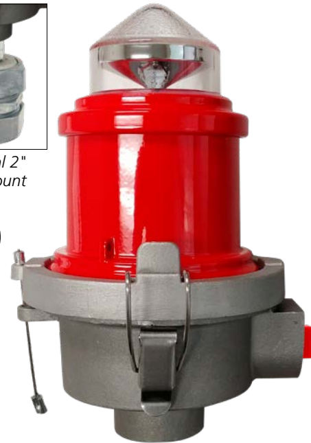
Single L-810 LED Steady-Burning Red Obstruction Light