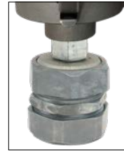
Optional 2" Pole Mount