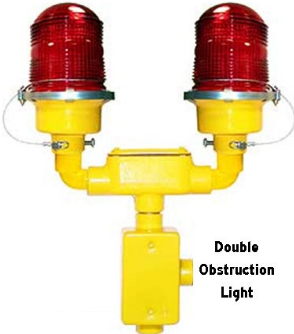
Double Obstruction Light

Flight Light, Inc. 2708 47 th Ave. Sacramento, CA 95822 (916) 394-2800