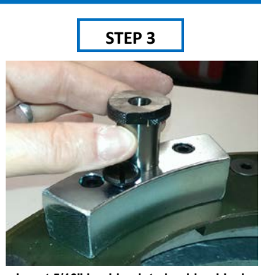
Insert 5/16" bushing into bushing block.