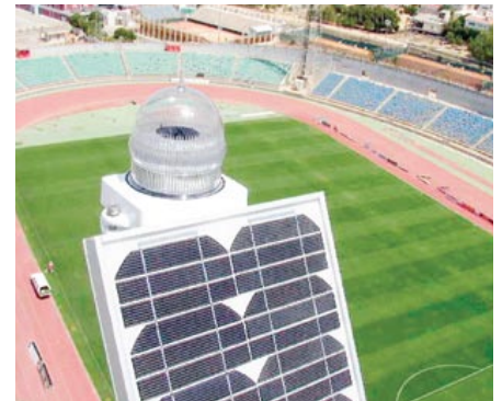
With minimal access for maintenance, stadium operators in Cyprus now enjoy hassle-free operation of AV23 units, installed as solar obstruction lights.