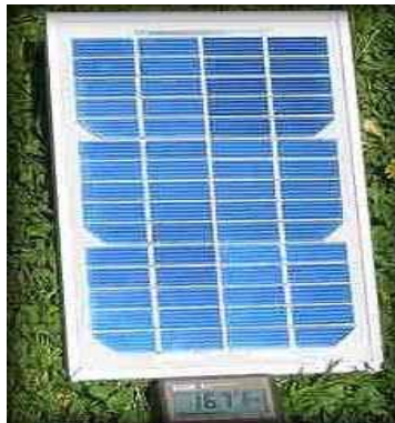
Figure 2. A Typical Solar Panel

When light photons from sunlight strike a photovoltaic cell, they free electrons in the silicon crystal structure, forcing them through an external circuit (battery or direct DC load), and then return them to the other side of the solar cell to start the process all over again. The voltage output from a single crystalline solar cell is about 0.5-volt DC with an amperage output that is directly proportional to the cell's surface area. Typically, 30 to 36 cells are wired in series (+ to -) in each solar module. This produces a solar module with a 12-volt DC nominal output (as high as 20 volts DC at peak power) that can then be wired in series and/or parallel with other solar modules to form a complete solar array to charge a 12-, 24-, or 48-volt DC battery bank.